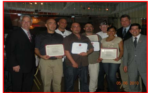
NY Congressmen, Wounded Warriors recipients & NYC Council presenting awards.

Another memorable dinner was that hosted by Kings County to honor our wounded veterans. That night four honorees, who fought and were wounded in Iraq and Afghanistan were recognized by the State of NY Assembly, Brooklyn's Borough Presidents Office and the NYC Council, with Certificates of Appreciation for their bravery in protecting our nation.