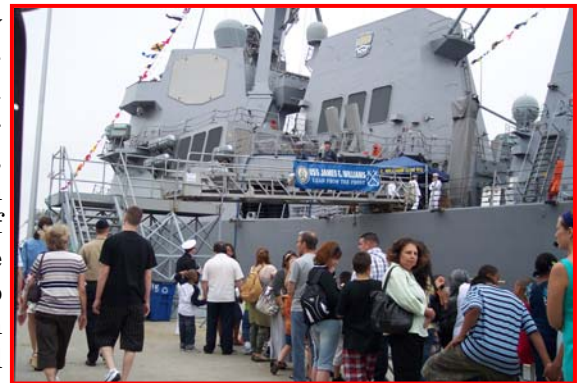
Parents, Teachers and School Children waiting to board Ship for Guided Tour by Naval Officer

We felt that it's about time we recognize part of what our Le-