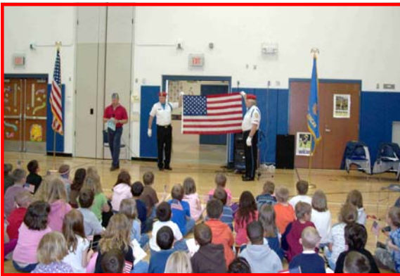
Flag Education Program—2009 Midlakes Primary School

The Americanism Commission for the Detachment of New York