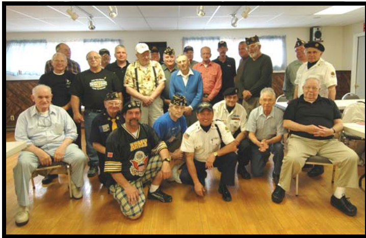
Photo of our luncheon from last year where we served about 60 veterans.

Post and the community for a homemade hot lunch together with music and gifts for all. This luncheon is funded completely by the SAL and is free for all veterans. We are very proud to be able to honor all of our heroes.