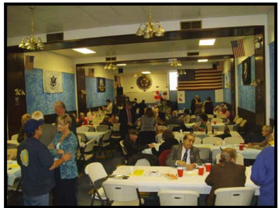
The Post Hall fills with those attending the Kings County SAL Fundraiser.