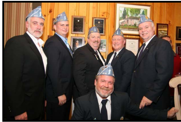
Westchester County visitation December 9, 2009

scholarship, essay contest and consolidated report forms. You must inform our squadron commanders the importance of the consolidated report form as these numbers reflect what we do as an organization for our veterans, children and our communities. It will also give us a stronger voice when we lobby for our veteran issue's, which is why we belong to the largest veterans service organization in the world the American Legion.