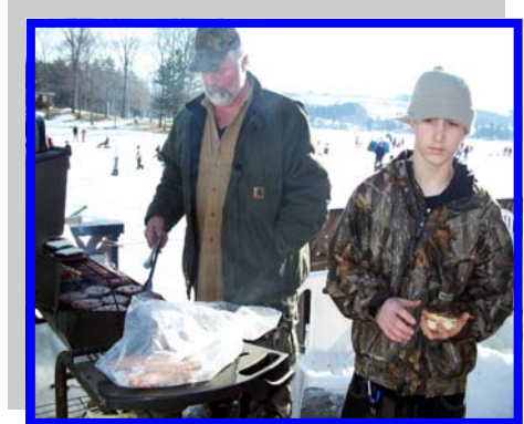
Free food & drink at the Derby

This is just one of the great examples of Children and Youth programs supported by Sons of The American Legion Squadrons throughout our great organization. Squadron 905 teams up with local businesses to provide every kid with a tip-up, reel, bait, hot dogs, hamburgers, and soda pop, along with other prizes for coming. No kid goes away empty handed and so I say thanks to all the members of Squadron