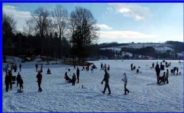
Springwater Squadron 905 Annual Ice Fishing Derby for 160 children

Greetings from the 7 th District. On Saturday, February 7 th Kern Robinson Squadron 905 in Springwater, Livingston County, held their annual Children's Ice Fishing Derby at Loon Lake and