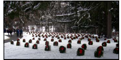
Bath National Cemetery 2009

I would also like to express my sincere thanks to you, officers and members of the Seventh District Sons of The American Legion, for your support. We are on track for another successful year because of your efforts and I am very optimistic as we go forward. Thank you