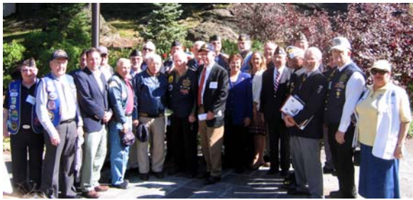
Photo from an event to honor the memory of the WWII submarine the USS Wahoo