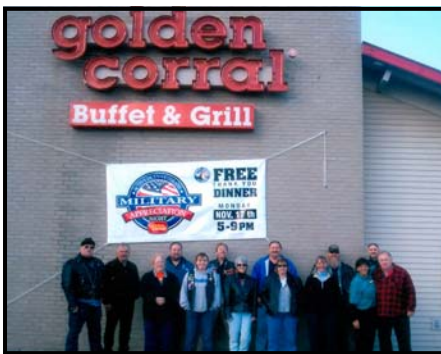
On December 6th the Sons

Squadron #574 organized a trip to Stratton VA Medical Center in Albany on November 9th. On their way they stopped at the Golden Corral for a group breakfast. "We had a few members from the Post in attendance for the first time, now realize how important and rewarding this trip is.