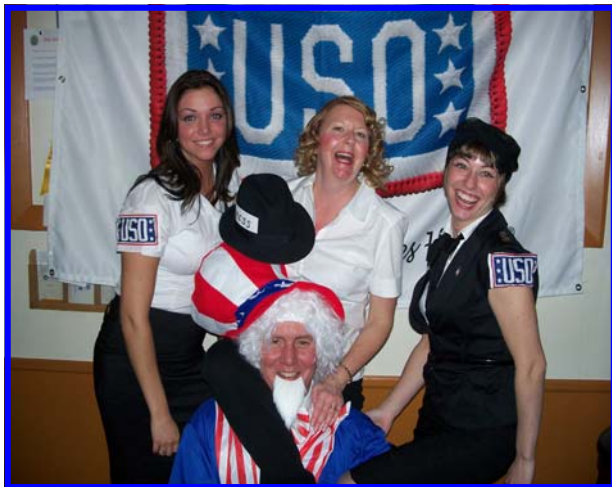
"The Girls with Uncle Sam"