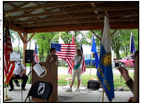
Flag Education & Retirement Ceremony held at Post 1107 in Union Springs