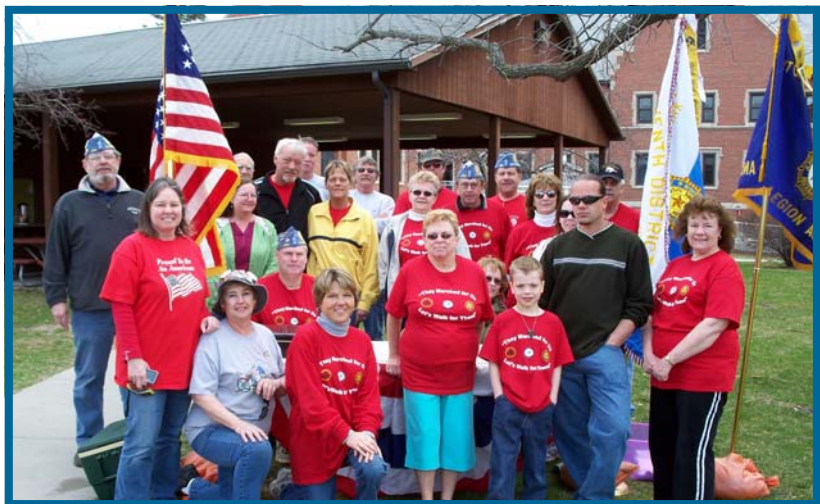
Ontario County VA walk-a-thon held at the Canandaigua VA raised almost $7,000

services, the Fisher House in Albany, and other Veteran programs throughout New York State.