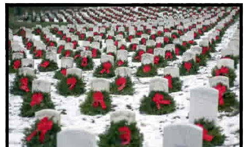
Christmas at Arlington National Cemetery

Records. Then go to e-vet recs and request copies of military personal records. Note that this information is only available to the veteran or next of kin. Click on "request military records" and fill out the four steps required. Print out a signature page that you can fax in or mail within 30 days. You should receive the veteran's records within two to four weeks.