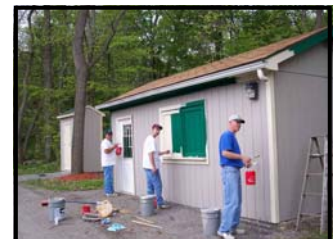
Camp Good Days