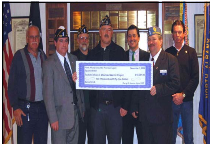
Squadron & Post 1610 members present a $10,051 check for the Wounded Warriors Project.