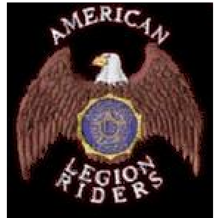
Ride with Patriotic Pride

American Legion Riders Vernice Suttle Post 113 Baldwinsville, New York