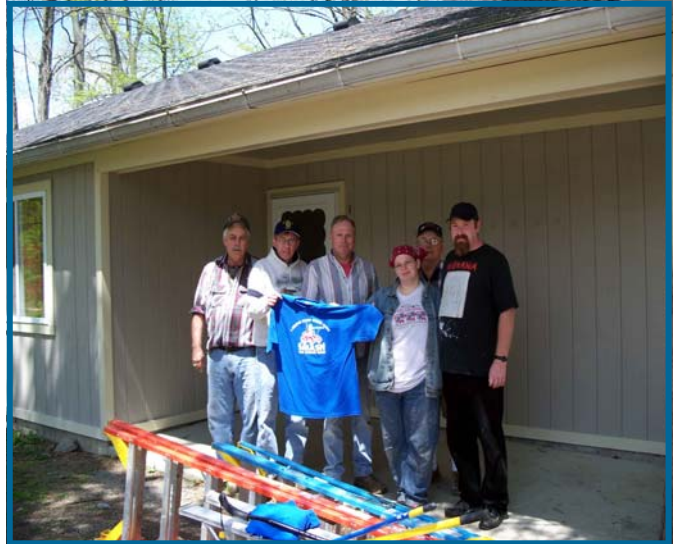
Painting crew at Camp Good Days & Special Times