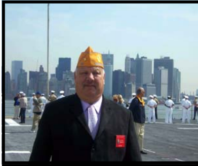
Earl visits the Big Apple