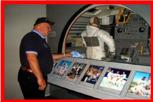
Earl Ruttkofsky, National Commander visits the "Cradle of Aviation Museum" in Long Island